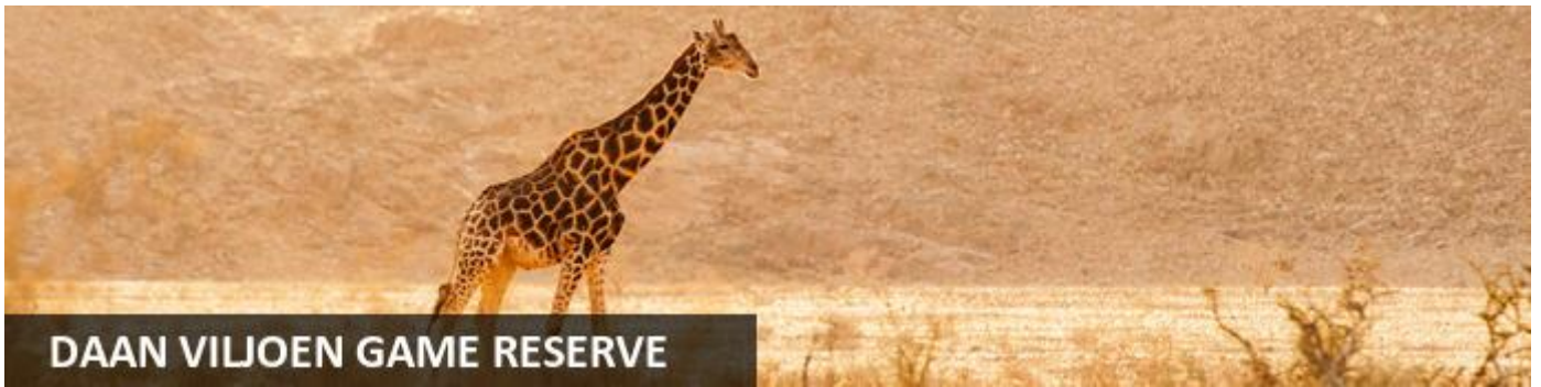
DAAN VILJOEN GAME RESERVE