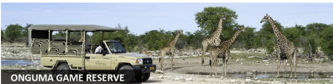
ONGUMA GAME RESERVE