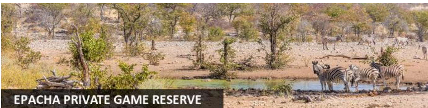
EPACHA PRIVATE GAME RESERVE