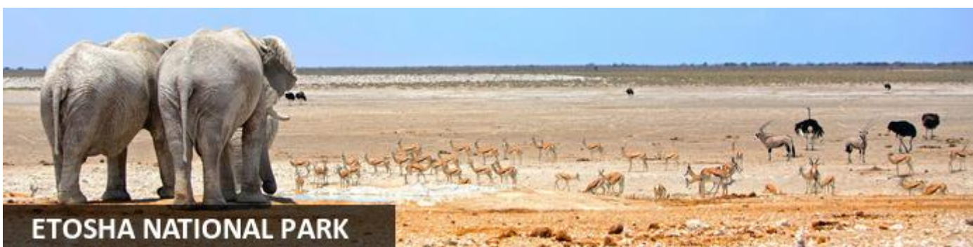
ETOSHA NATIONAL PARK