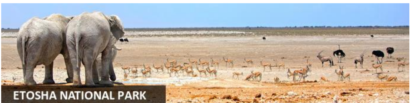
ETOSHA NATIONAL PARK