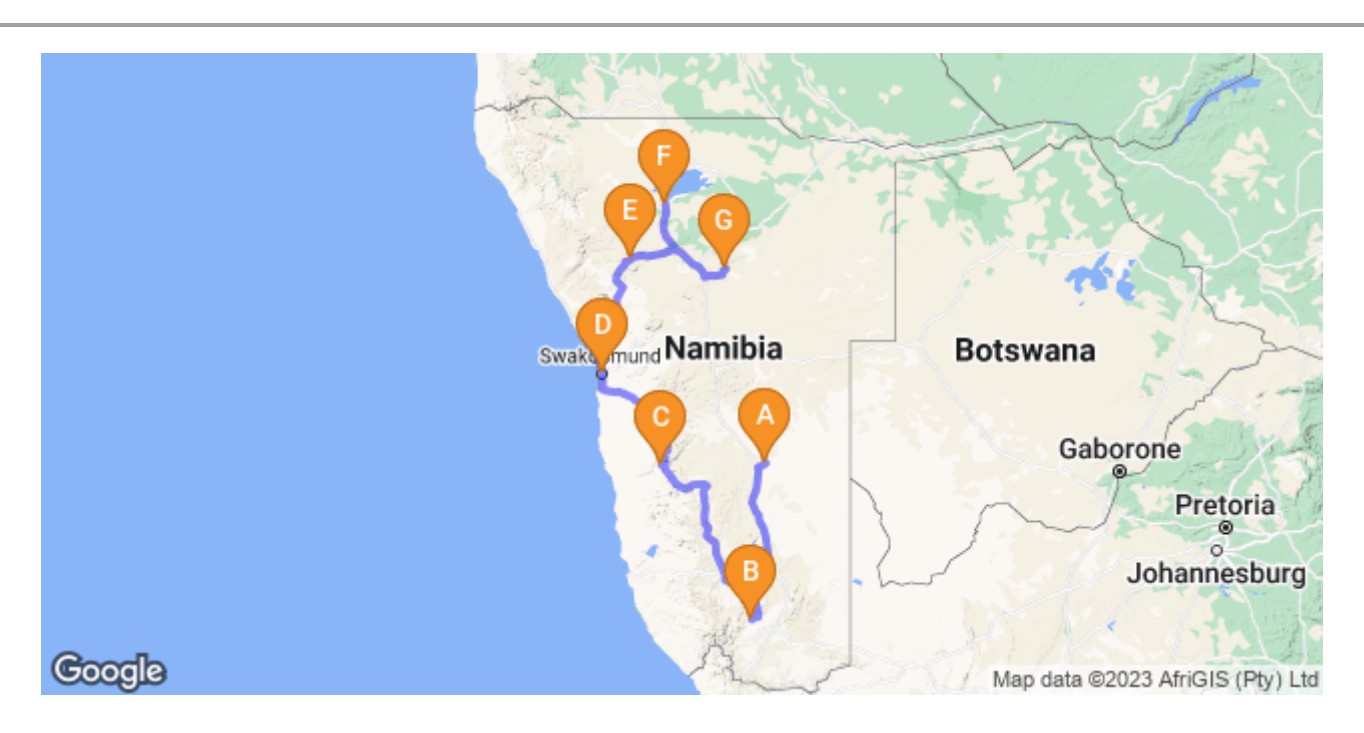
Click here to view your Digital Itinerary

Kalahari Namibia - Fish River Canyon - Sesriem - Swakopmund - Damaraland - Etosha South - Waterberg Plateau National Park