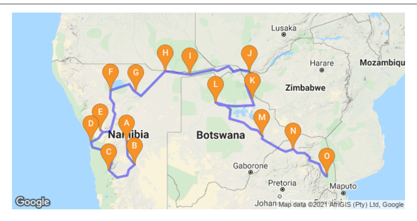
Click here to view your Digital Itinerary