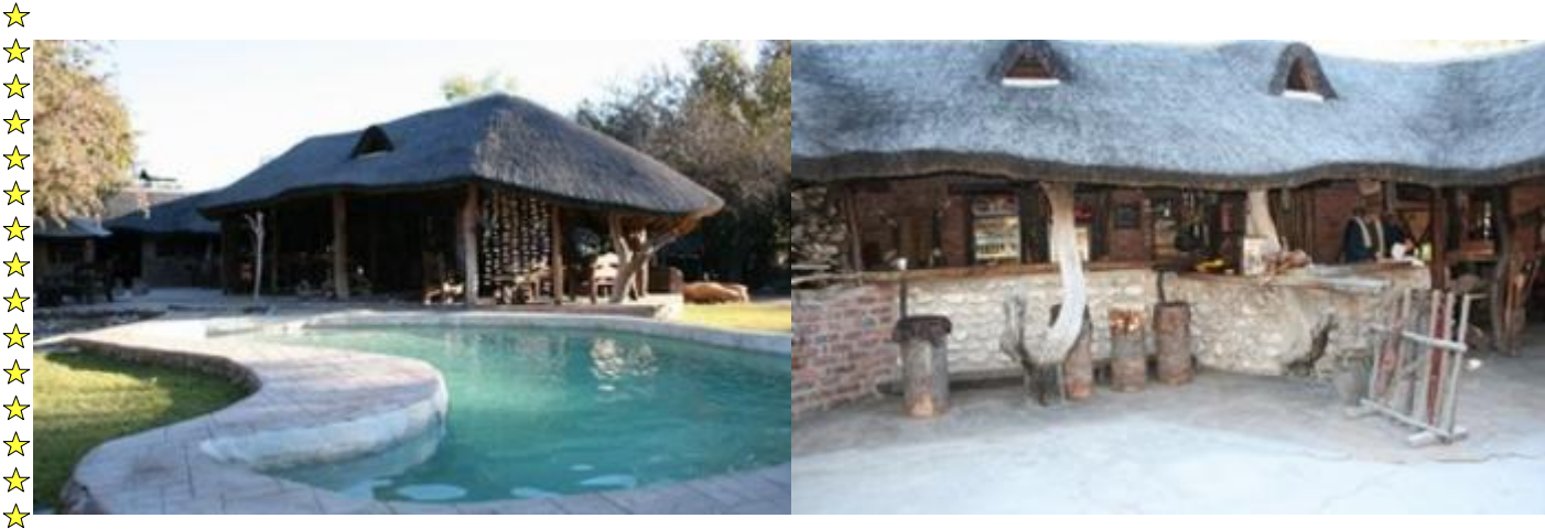
********************************** \Delta \frac{1}{2} Page