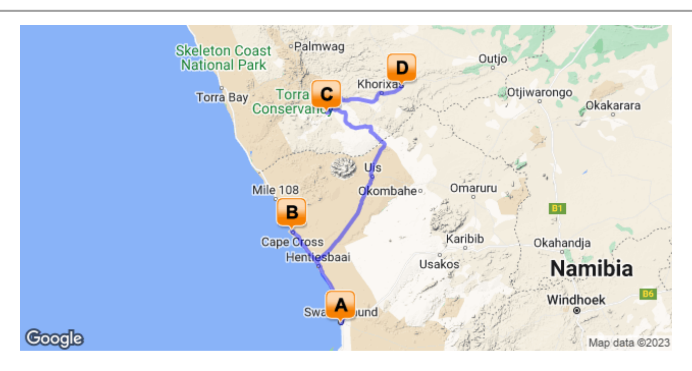
Click here to view your Digital Itinerary

Swakopmund - Cape Cross - Twyfelfontein - Damaraland