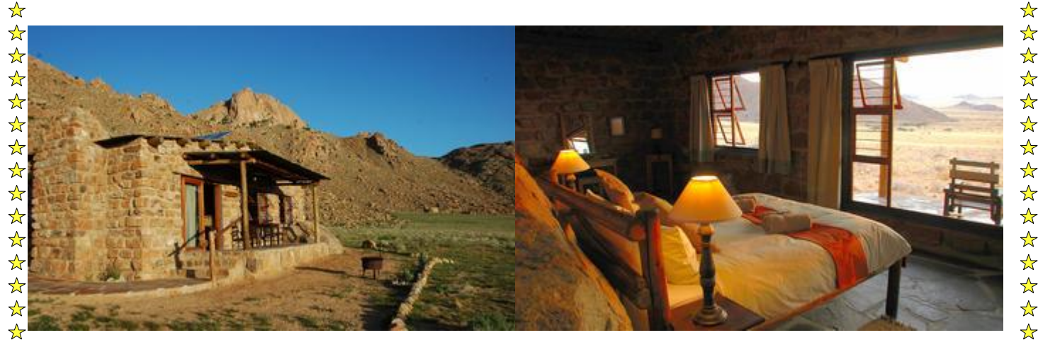
\frac{1}{2} Page | 17