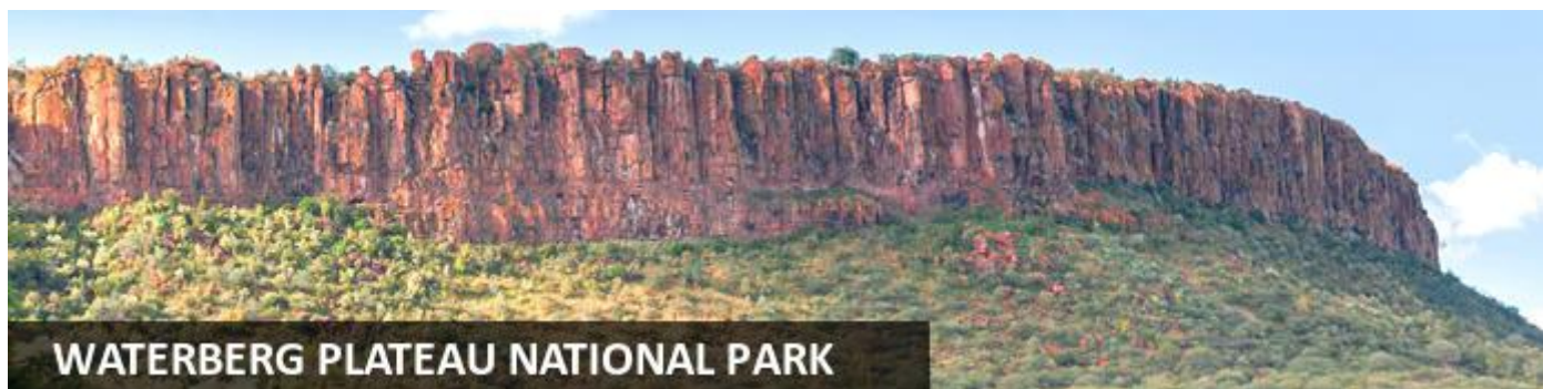
WATERBERG PLATEAU NATIONAL PARK