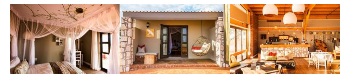
Day: 2-3: Kalahari to Fish River Lodge 356km

Location: Approximatly 30 km northeast of Mariental on the C 20 (Kalahari).