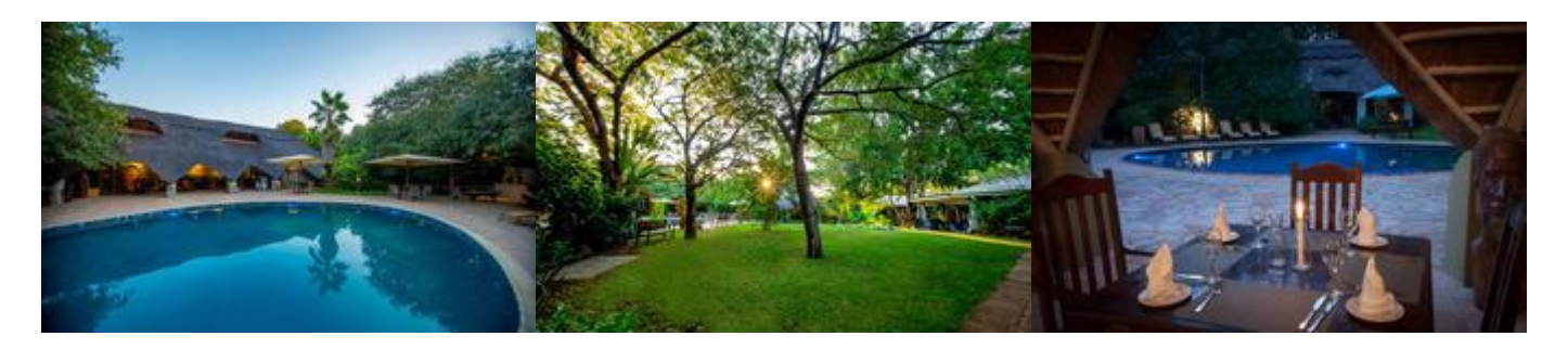
Day 12: Victoria Falls (Bayete Guest Lodge)

A full English breakfast is served to guests in the Caldecott Boma every day. Lunch and dinner are also available on special request and are delicious home cooked meals. BBQ's are available for group bookings or by special request.