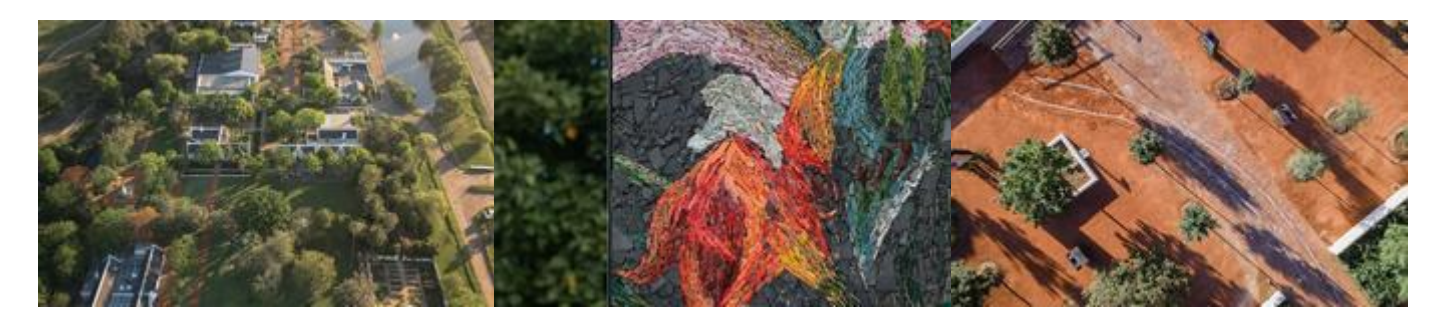
<u>Day 5-6: to Spier Wine Farm, Stellenbosch to Perry's Bridge Hollow Boutique Hotel, Hazyview</u>

Spier's environmental and social initiatives are many and varied, and include ways to reduce water usage. 100% of its wastewater, and over 80% of its solid waste, is recycled. Spier supports local communities through the treepreneur project, which encourages people in impoverished communities to grow trees in exchange for essential goods. The estate also supports entrepreneurs by helping them create microenterprises linked to Spier.