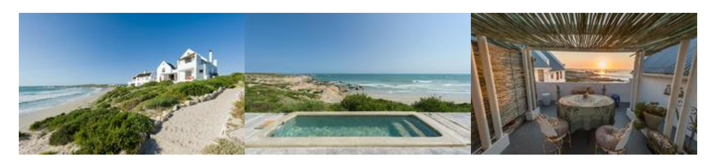
<u>Day 4 : Oystercatchers Haven at Paternoster, Paternoster to Spier Wine Farm, Stellenbosch</u> <u>Distance: 160.76km Travel Time: 1:51 hours</u>

This beautiful morning guest will drive breakfast to Stellenbosch which is Just 45 minutes from Cape Town, Stellenbosch is an enticing Western Cape destination with an exciting culinary scene, photogenic historic buildings, and a youthful atmosphere. The beautiful university town is surrounded by mountains, vineyards, and nature reserves, making it a charming base for wine tours, day trips and outdoor adventure. The town centre is characterised by both a "holiday feeling" - sublime art galleries, award-winning restaurants and alluring boutiques fringe leafy cobbled streets - and a sense of aliveness as students bustle between faculties.