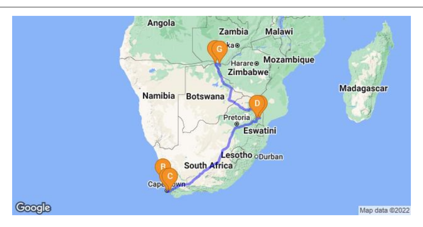
Click here to view your Digital Itinerary

Cape Town - Paternoster - Stellenbosch - Hazyview - Kruger National Park - Kasane - Victoria Falls (Zimbabwe) 13 Days / 12 Nights