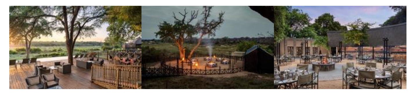
<u>Day 9: Kruger national Park To Chobe River Front (Flight from OR Tembo to Kasane International Airport)</u>

National Park. The guest rooms, suites and self-catering chalets are modern, comfortable and African-inspired in design and furnishings. Each accommodation is equipped with air conditioning, Wi-Fi, TV, minibar fridge, tea/coffee facilities, hairdryer and a private bathroom. The three-bedroom two-bathroom chalets are comfortable, spacious and well appointed, equipped with an open plan lounge, fully fitted kitchen and a private enclosed patio with a BBQ oven. Guests can enjoy dining at the onsite restaurants serving delicious local and international cuisine or relax at the pool bar with a refreshing cocktail while watching the animals drink at the river below. Additional amenities and services include a swimming pool, private dining experiences, event hosting, a fitness centre, spa and unique big 5 safari experiences.