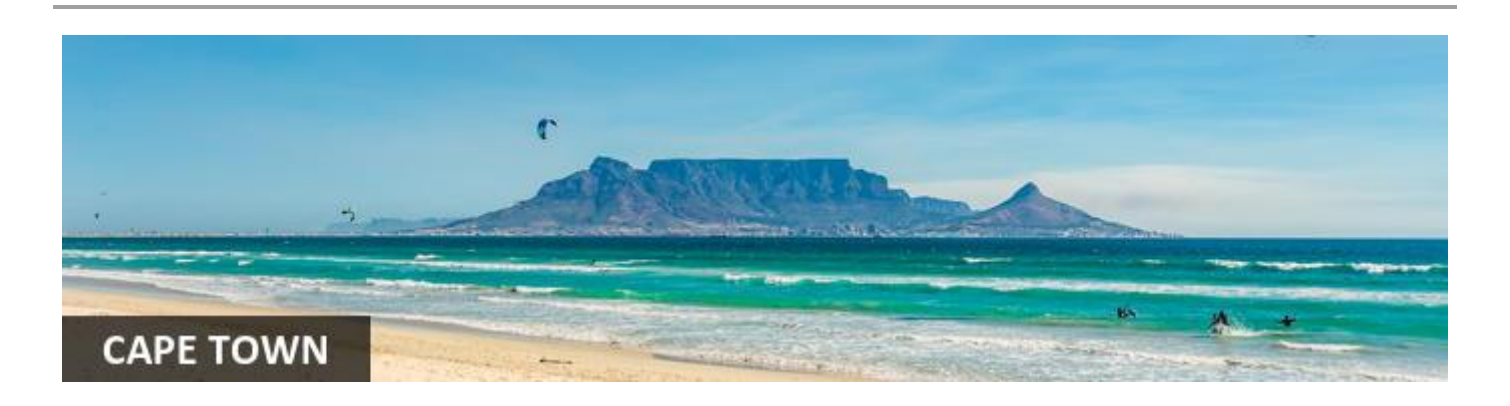
Day 2: Visit Dutch East Indian Garden, Castle of the Cape, South African Museum, Malay quarter, District 6 and Greenmarket Square

Day 1:Township Tour and Visit Table Mountain.