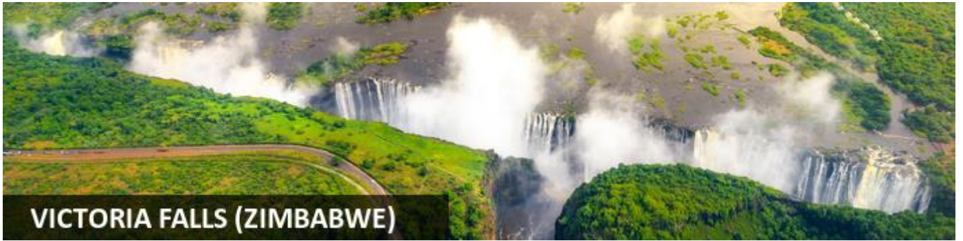
VICTORIA FALLS (ZIMBABWE)