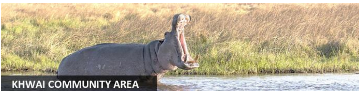
KHWAI COMMUNITY AREA