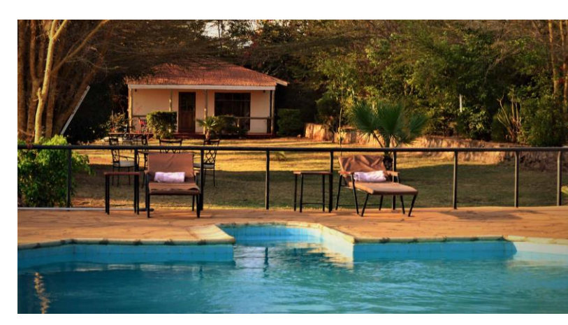
DAY 9: KARATU/NGORONGORO CONSERVATION AREA - KILIMANJARO INTERNATIONAL AIRPORT