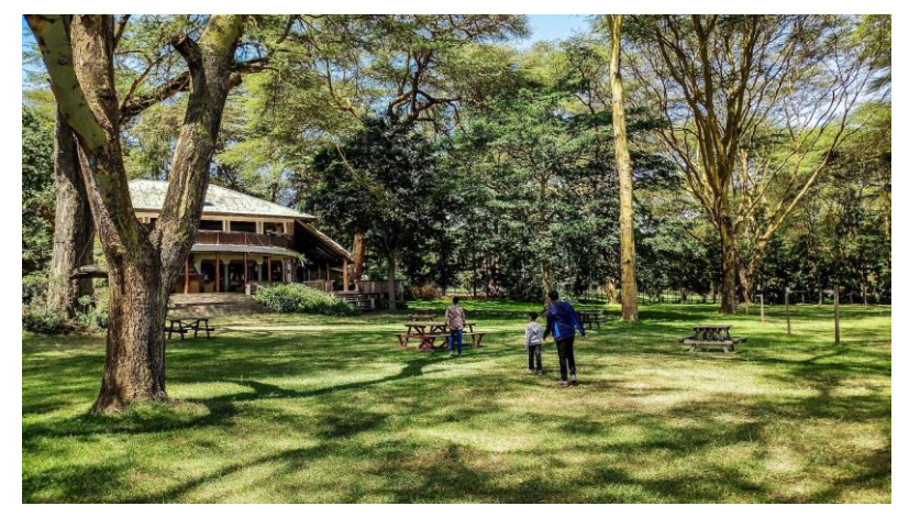
DAY 7: LAKE NAIVASHA TO NAIROBI

Guest wake up and after a nice breakfast, depart for a game drive in Lake Naivasha Park and then later drive to Nairobi, enjoying lunch on the route and arriving at your hotel in the evening.