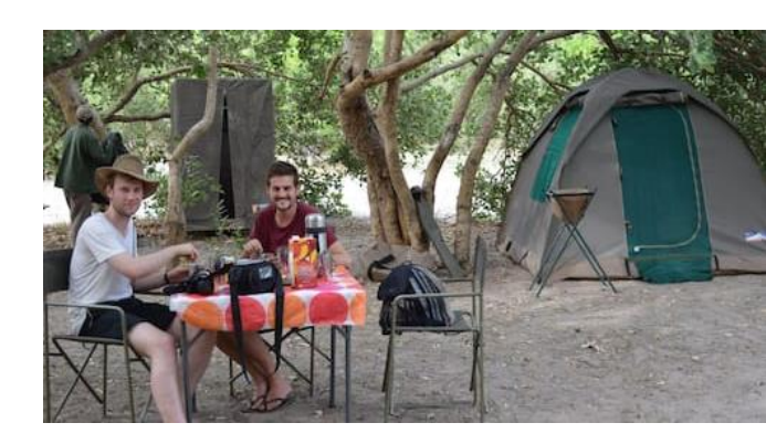
DAY 4: MOREMI TO KHWAI COMMUNITY AREA 117 KM