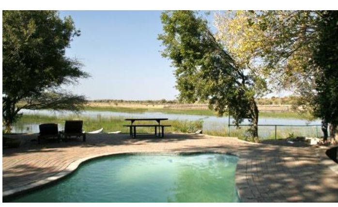
DAY 7: MAUN TO OKAVANGO DELTA (65KM)