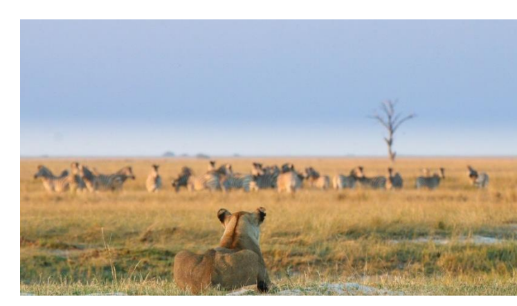
DAY 11: CHOBE TO VICTORIA FALLS 162 KM