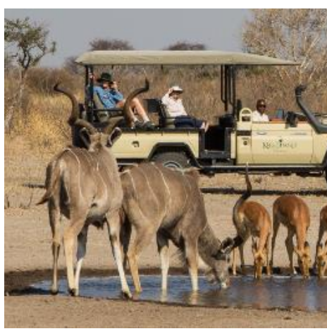
DAY 6: XHUMAGA TO MAUN (140.2 KM)