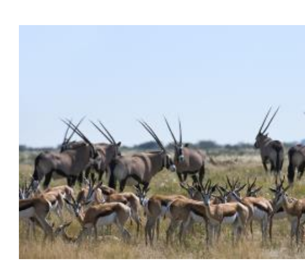
DAY 5: XHUMAGA