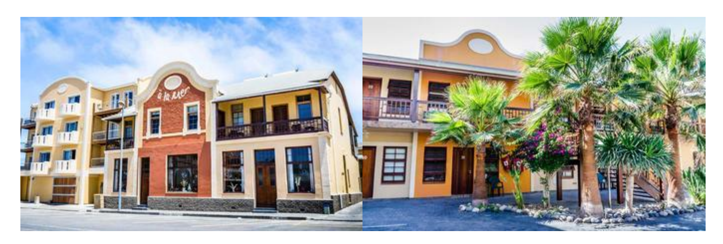
Basis Bed and Breakfast