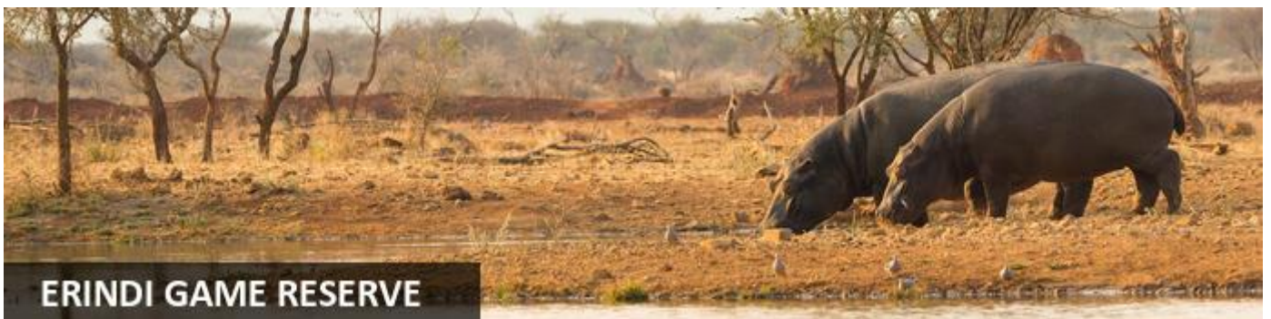
ERINDI GAME RESERVE