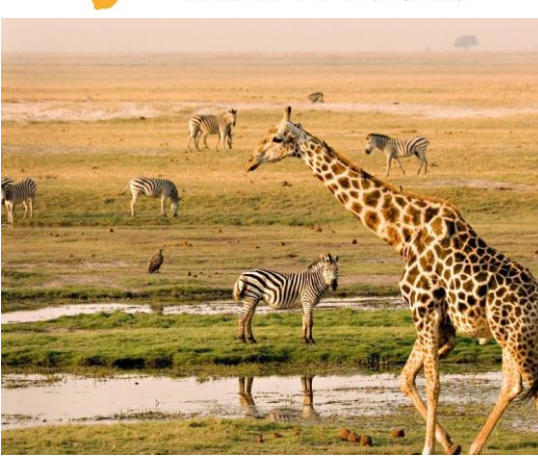
DAY 21: CHOBE TO VICTORIA FALLS 142 KM