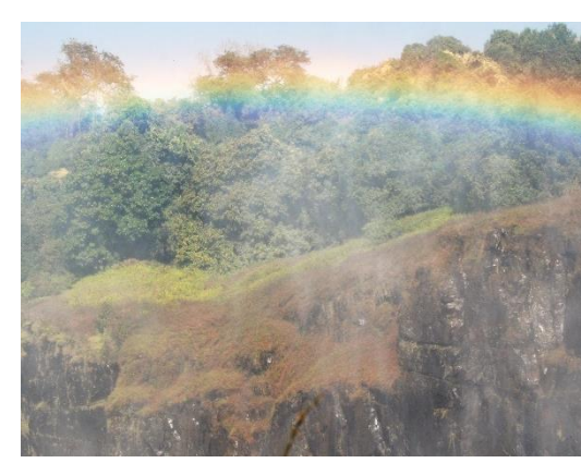
DAY 23: VICTORIA FALLS AREA

Accommodation: Shearwater Explorers Village Campsite, Victoria Falls, Zimbabwe / Similar