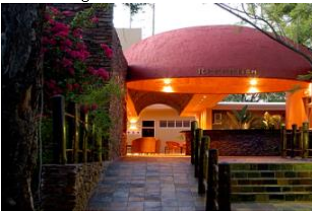
DAY 11: RUACANA AREA