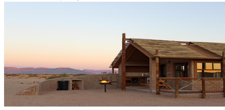
DAY 6- SOSSUVLEI / SESRIEM AREA