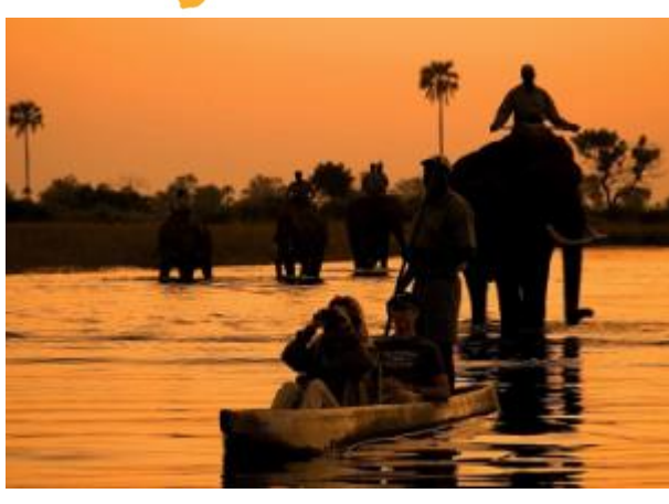
DAY 16: OKAVANGO RIVER TO OKAVANGO DELTA 317 KM