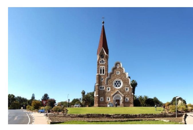
DAY 15: WINDHOEK TO GHANZI 517 KM

Guest will have breakfast and drive to their next destination, as they are passing by Gobabis which is the next town, guest will have the opportunity to buy lunck packs or get lunch in that ton before crossin the border to Botswana Ghanzi which is situated 300 kilometres southwest of Maun and just north of the Trans-Kalahari highway, which runs from Lobatse in Botswana to Walvis Bay in Namibia, the small town of Ghanzi is sometimes referred to as the 'Capital of the Kalahari'. It serves as the administrative centre of the Ghanzi district which covers a vast area of cattle ranches and farmland in the west of Botswana. After checking in guest will visit the San Village