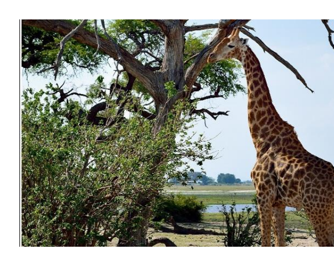
DAY 24: VICTORIA SHERWATER VILLAGE TO VICTORIA FALLS AIRPORT (21.1 KM)

This is the last day of the tour, guests will refresh and pack up in the morning and depart after breakfast to the Airport.