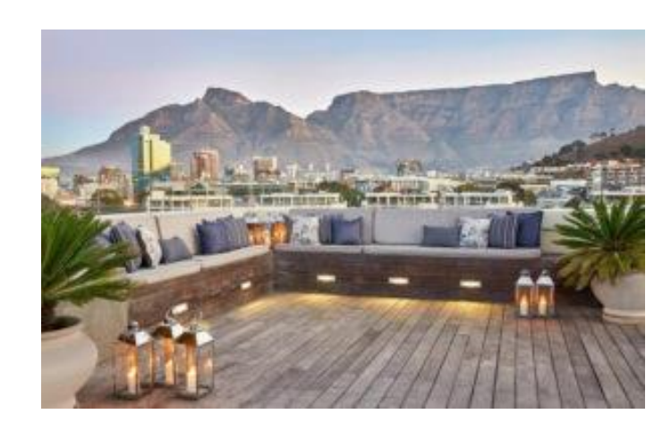
DAY 6-DAY 7: PRETORIA LUXURY GUESTBED, PRETORIA

The cosmopolitan city of Pretoria, also known as 'Tshwane', is situated in the province of Gauteng and functions as one of three capitals of South Africa. Pretoria has been dubbed 'The Jacaranda City', which is owed to the annual bloom of magnificent purple blossoms that adorn the Jacaranda trees which line the wide avenues of the city. This cosmopolitan city boasts several historic monuments, fine government buildings, and fascinating museums. Visitors can enjoy a wide variety of interesting sites including: The Transvaal Museum, a natural history museum showcasing an ancient dinosaur fossil found at the nearby Cradle of Humankind; the Pretoria Botanical Gardens, offering visitors a glimpse of different biomes; and the Voortrekker Monument, a National Heritage Site. Don't miss the nearby Austin Roberts Bird Sanctuary as well as the beautiful Wonderboom and Groenkloof Nature Reserves.